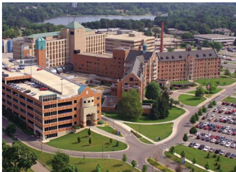
Bronson Methodist Hospital

200 North Park Street Kalamazoo, MI 49007-3731